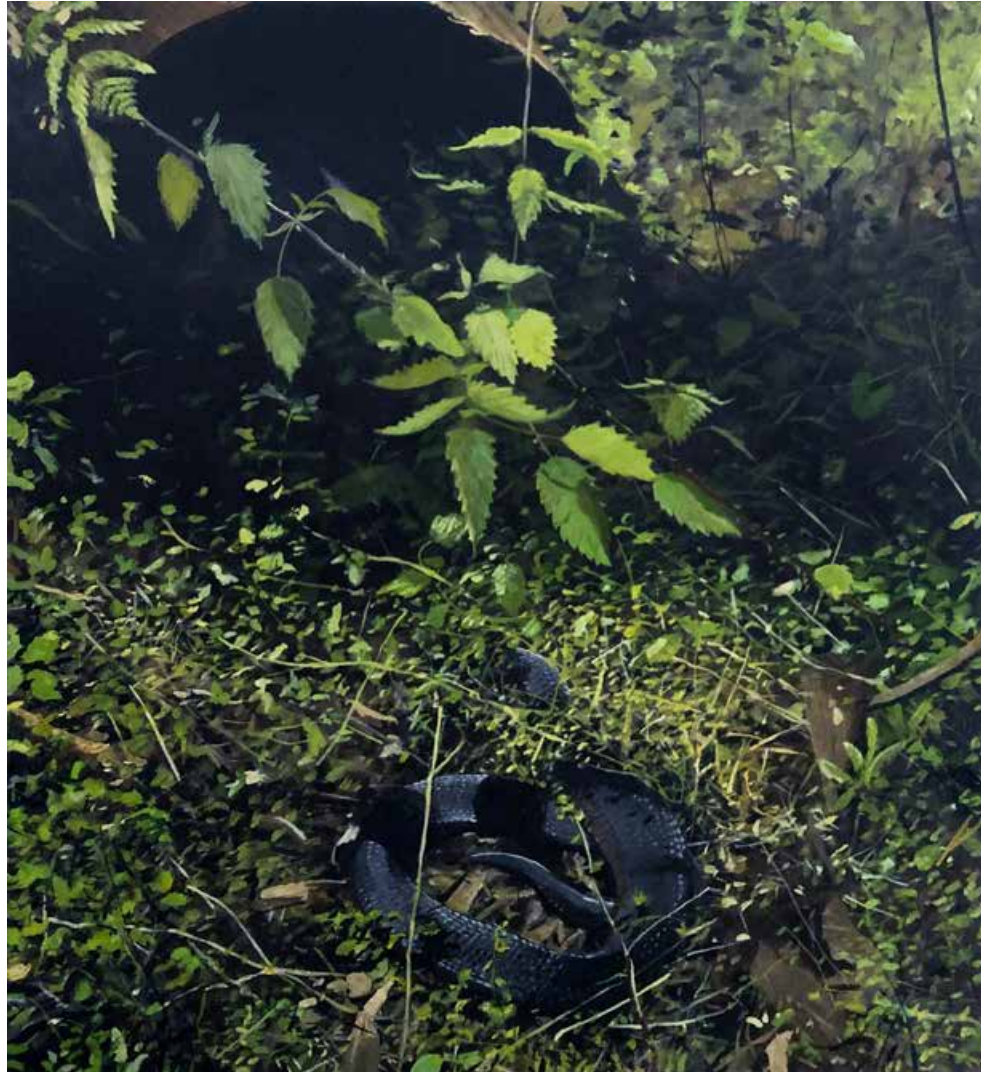
IMAGE > Grant Nimmo, Is Fear Ciúin Mè , 2020, oil on linen, 61 x 50cm.