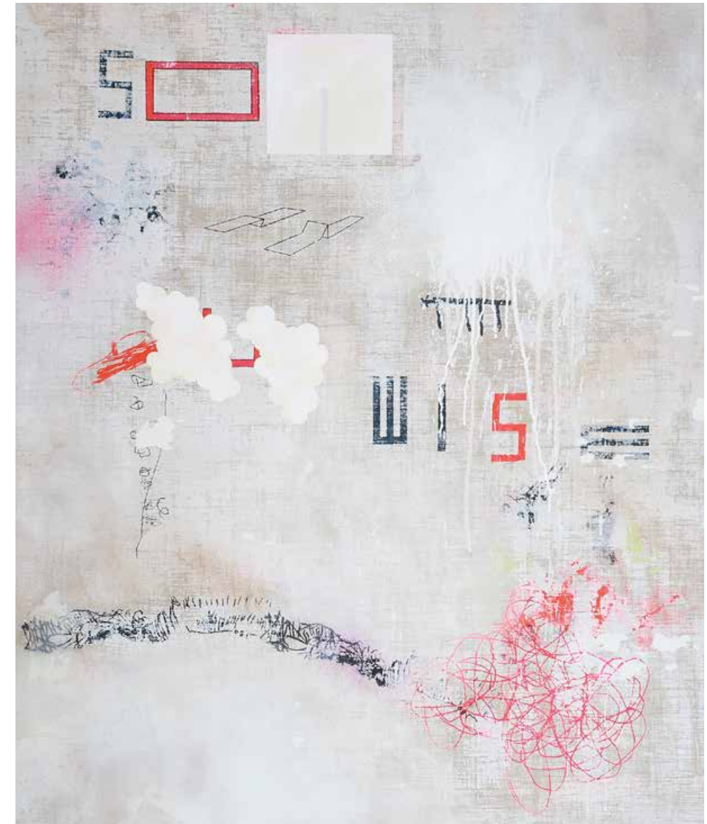
IMAGE > Sarah crowEST, SO WISE , 2019, acrylic on Belgian linen, 127 x 102cm.

I was delighted to win a luxurious amount of art supplies. I am still using some of them five years later!