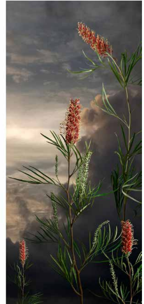
IMAGE > Valerie Sparks, Sanctuary Protea and Sanctuary Grevillea , 2020, inkjet print, 170 x 75cm each.