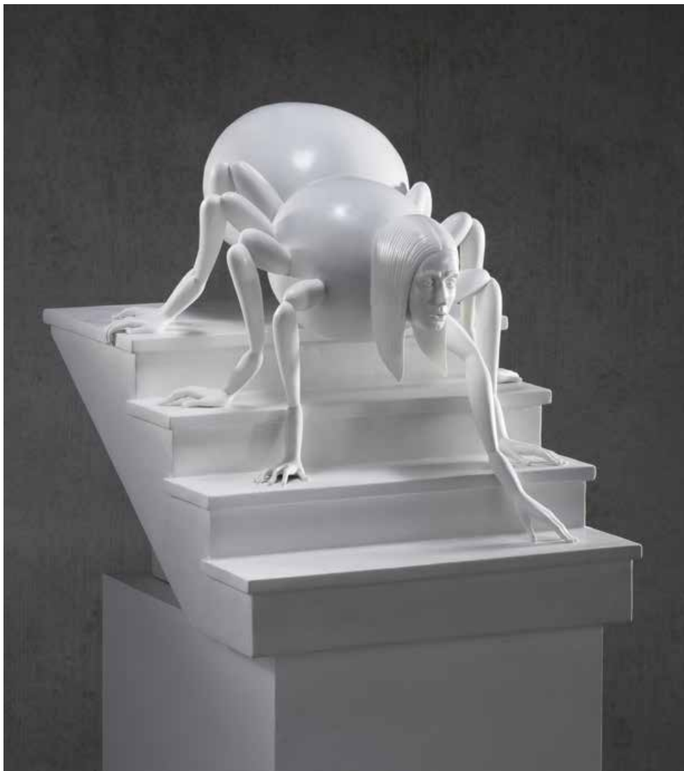
IMAGE > Richard Stringer, The Chrysalids , 2020, alabaster, 72 x 77 x 60cm.