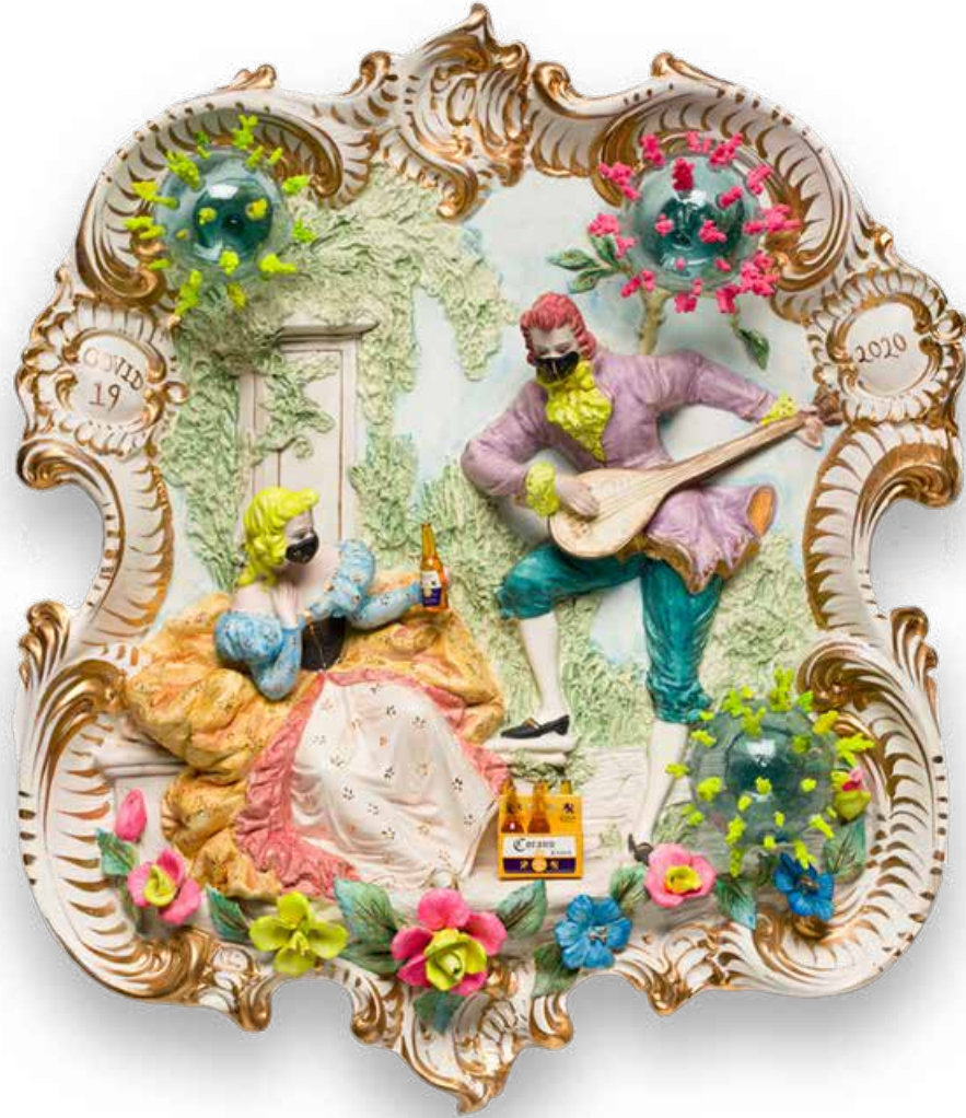
IMAGE > Penny Byrne, Pandemic Sonata in C Major, 2020 , Vintage Italian ceramic wall plaque, miniature Corona beer bottles, Japanese handblown glass fishing buoys, vintage coral from a Coolangatta souvenir, epoxy resin, acrylic paints, 47 x 40 x 11cm. Music: Antonio Vivaldi, Trio Sonata in C Major, RV82.11. Larghetto-Lento .