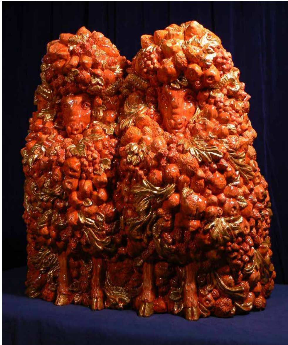
IMAGE > William Eicholtz, Hybrid Harvest , 2008, synthetic glazed polymer cement, 80 x 70 x 50cm.