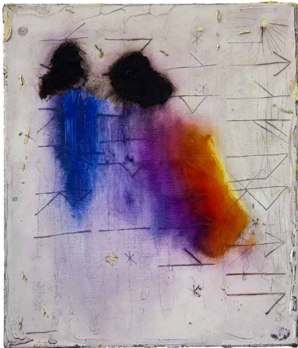
IMAGE > Scott Miles, Refractor (first light) , 2020, oil on canvas, 35.6 x 31cm.