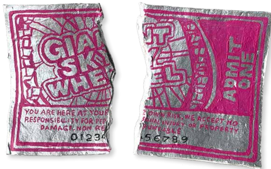
IMAGE > Kenny Pittock, The ticket , 2020, acrylic on kiln fired earthenware ceramic, 5 x 10 x 1cm.