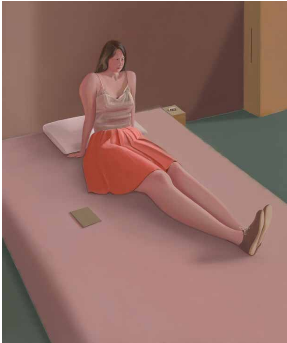
IMAGE > Prudence Flint, The Waiting , 2020, oil on linen, 122 x 102cm.