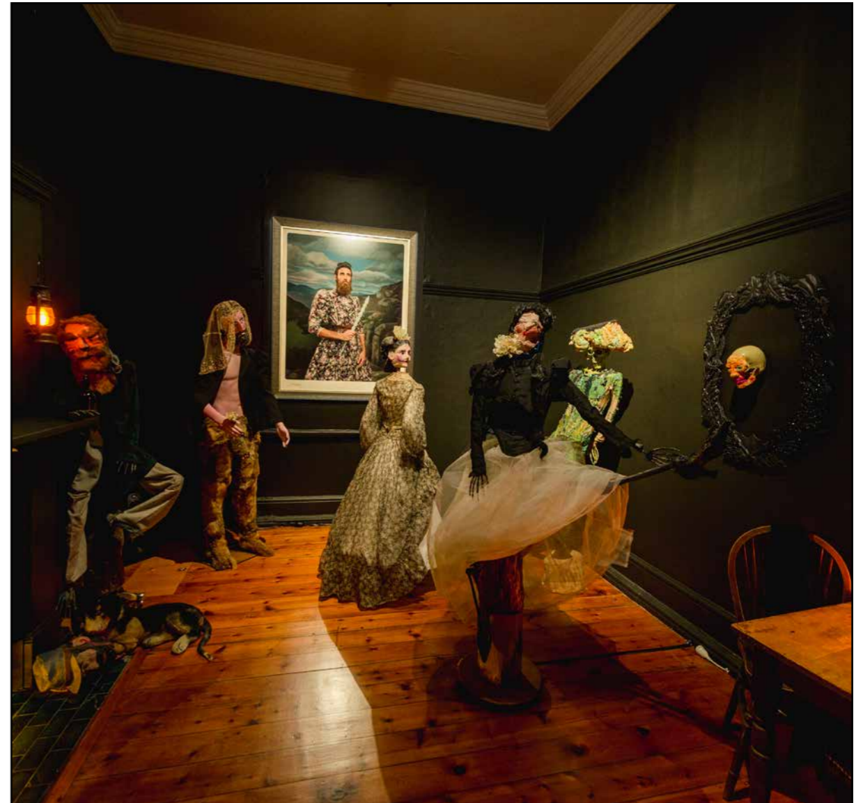
IMAGE > Jacqui Stockdale, The Outlaws' Inn [installation view], 2020.