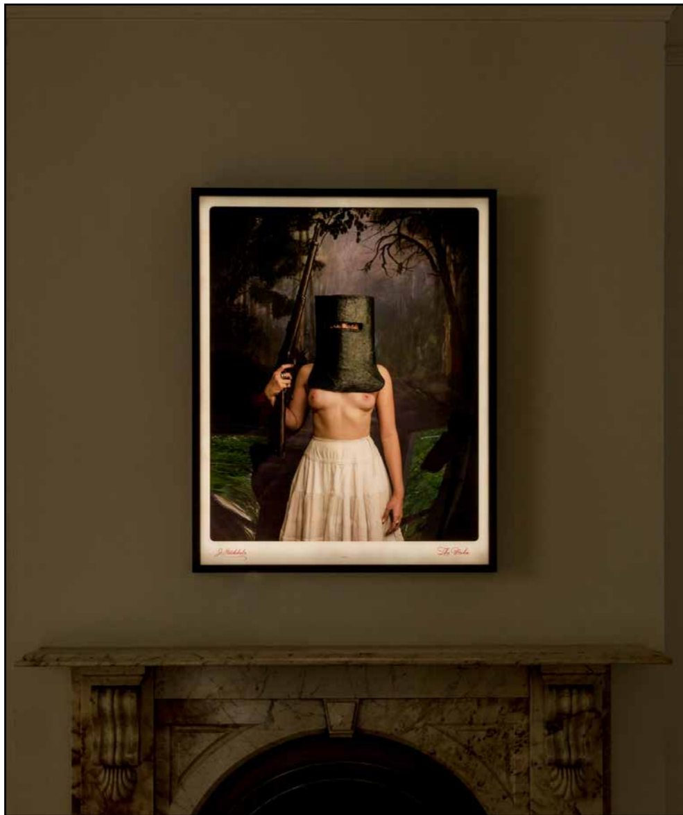
IMAGE > Jacqui Stockdale, Historia [installation view], 2015 – 2020. C-type print with lightbox.

Historia is based on a work titled Historia , 2015 from The Boho series, which marked the start of Stockdale's exploration of the Kelly story. 2 In this work, "Stockdale mobilises her powers of masquerade to undermine Ned Kelly's mask as a symbol of masculine nationalism, transferring its potency to an anonymous woman." 3 Both the sculpture and the lightbox speak to the regaining of female power in recent times, as well as a deep admiration for the strength and resilience of women of the past.