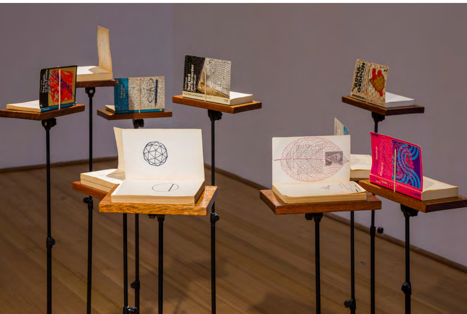
Kylie Stillman, Morning Pages , 2017, installation view, installation of ten embroidered books on timber bases and music stands. Cotton thread, paperback book, 15 x 12 x 19 cm each. Supported by the City of Melbourne Arts Grants Program.