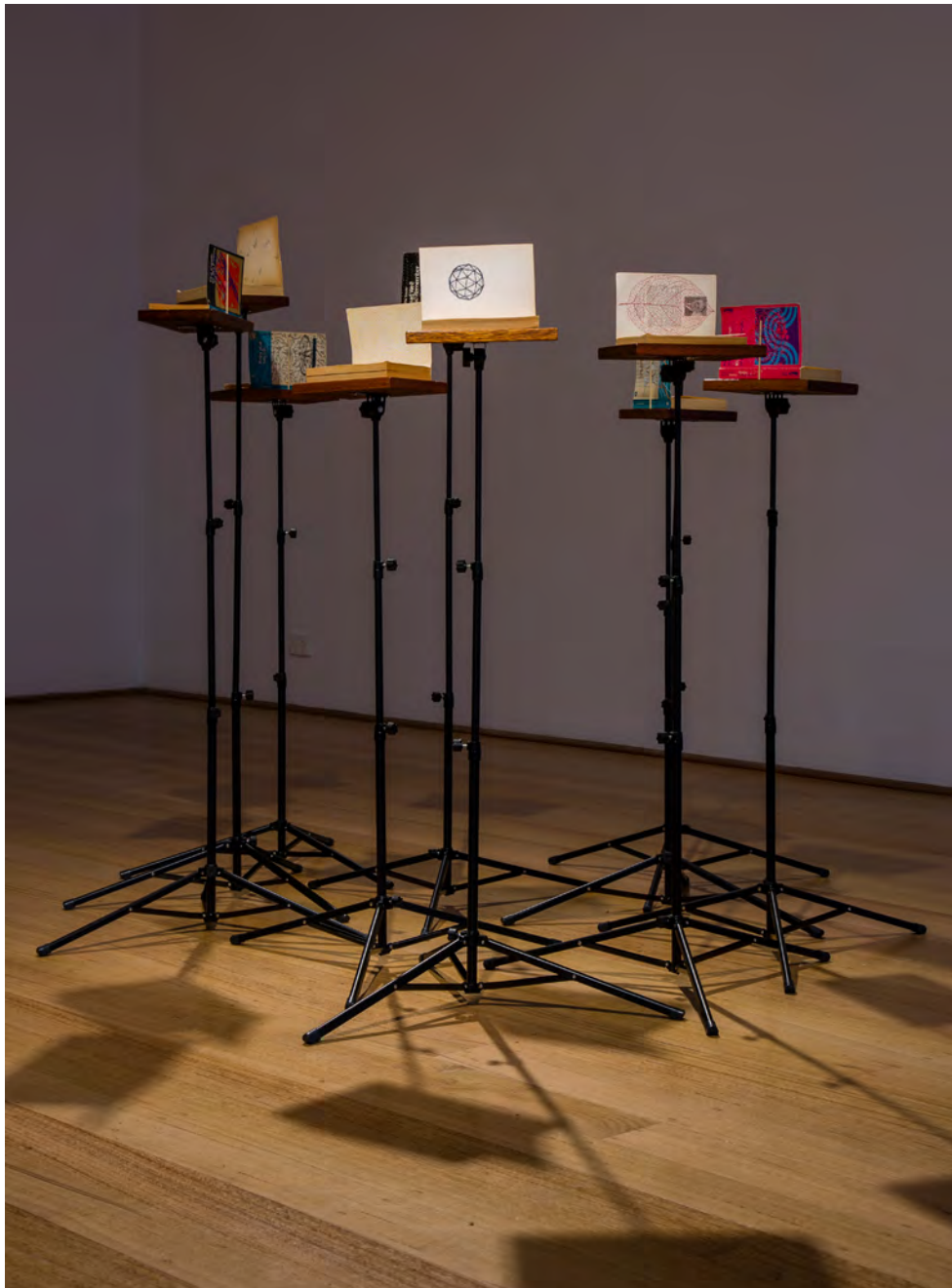
Kylie Stillman, Morning Pages , 2017, installation view, installation of ten embroidered books on timber bases and music stands. Cotton thread, paperback book, 15 x 12 x 19 cm each. Supported by the City of Melbourne Arts Grants Program.