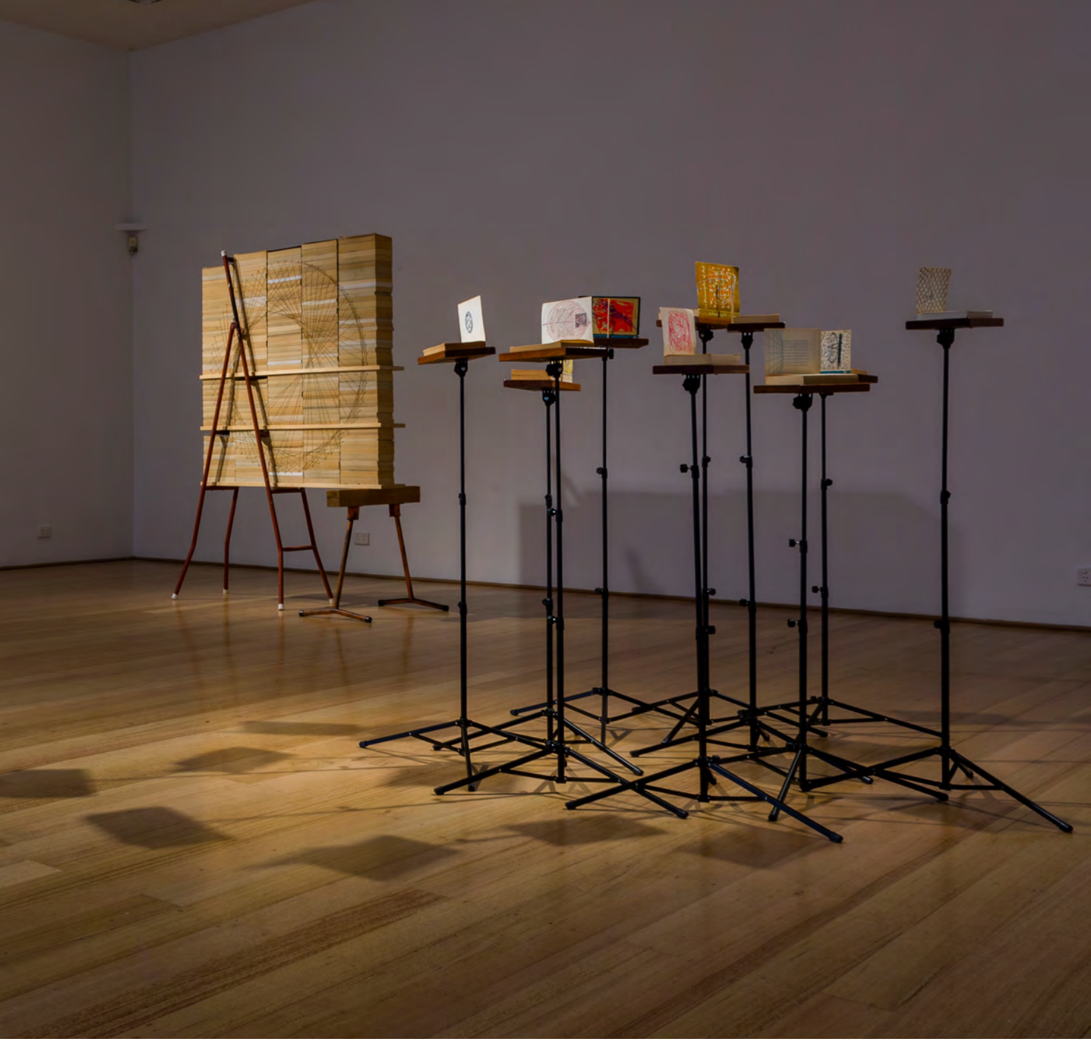
Kylie Stillman, The Opposite of Wild , 2017, installation view, dimensions variable.