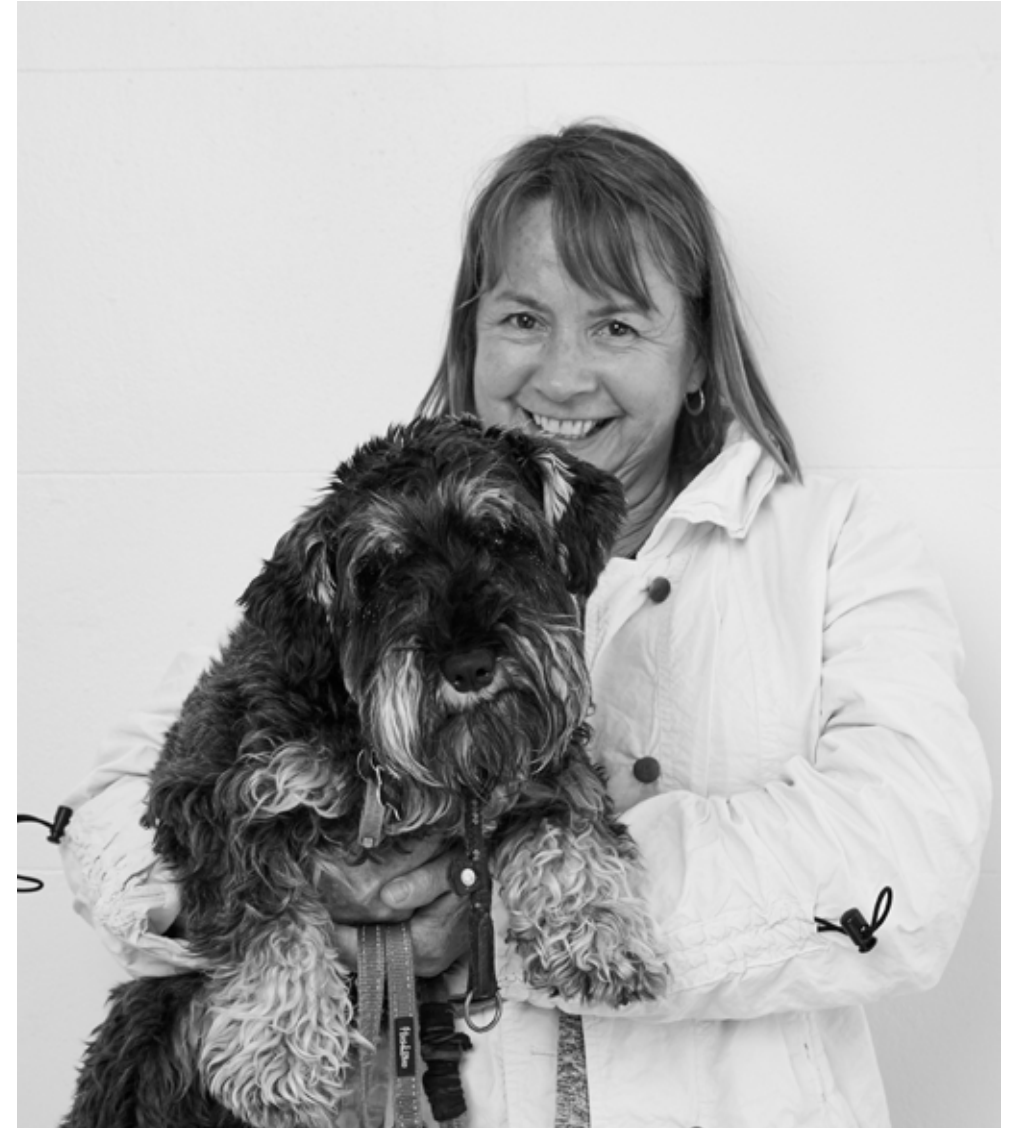
Linden Locals, Christine , 2018.