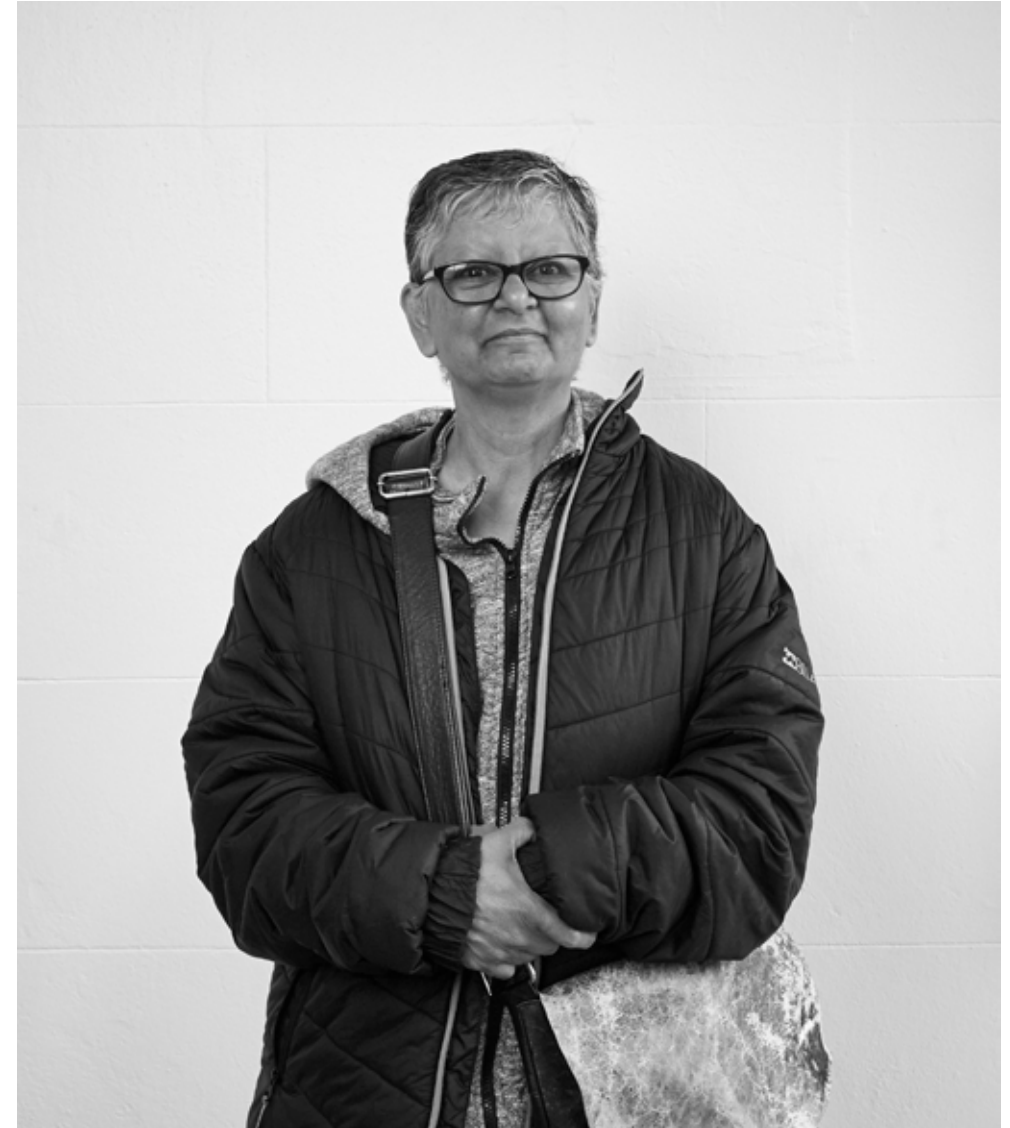
Linden Locals, Jan , 2018.