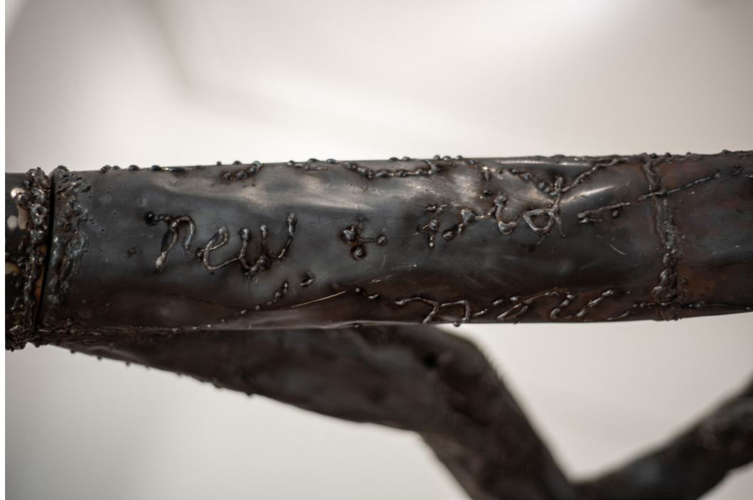
IMAGE > Nell, On a withered tree, ghosts bloom [installation detail], 2023, stainless steel, hand-blown glass, dimensions variable.