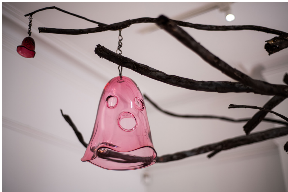
IMAGE > Nell, On a withered tree, ghosts bloom [installation detail], 2023, stainless steel, hand-blown glass, dimensions variable.

On a Withered Tree, Ghosts Bloom , a new work for this exhibition, a large leafless tree rises out of the building's foundations. It acknowledges the palimpsest of place embedded in this location; a plain populated with trees and vegetation, cared for by First Nations People prior to settlement and a building built by migrants and named after a German lime tree. It is a tree that welcomes us under its canopy and while dormant remains in a state of growth and flux.