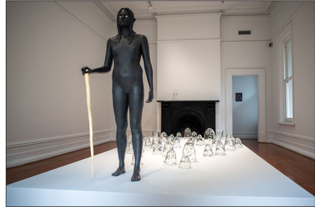
IMAGE > Nell, A white bird flies in the mist, a black bird flies in the night, a woman walks, wild and free, she is not afraid to die [installation view], 2008, bronze, mother of pearl, resin, hand-blown glass, dimensions variable.

to place. The title of the exhibition, Old New Wave , plays on the musical term New Wave and pays homage to St Kilda as one of Australia's most important musical suburbs; the home of bands such as Hunters and Collectors and The Birthday Party and iconic venues including The Crystal Ballroom, the Espy and Prince of Wales. It reflects on St Kilda's bayside location and changing history as well as Linden's building, a site that for over a century has welcomed waves of people as it transformed from a private dwelling to a boutique hotel and now a contemporary art gallery.