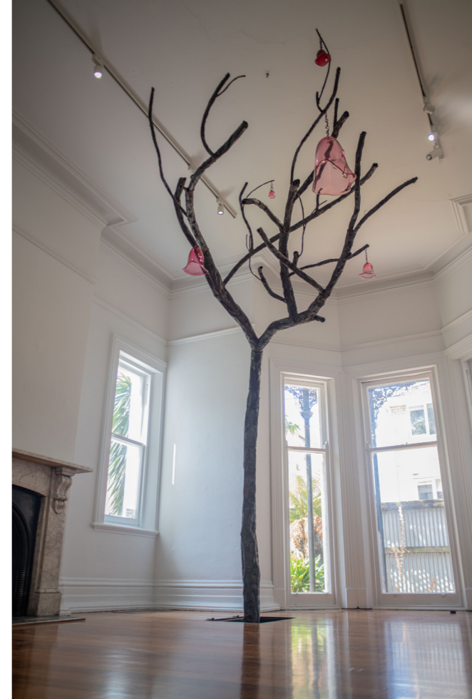
IMAGE > Nell, On a withered tree, ghosts bloom [installation view], 2023, stainless steel, hand-blown glass, dimensions variable.