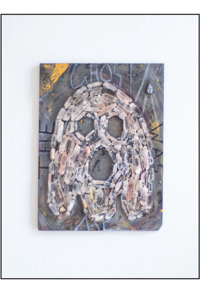
IMAGE > Nell, THE GHOST WAS ME [installation view], 2023, crystals, epoxy clay, glue, varnish and acrylic paint on slate from South Eveleigh, 30.5 x 22.5 cm.