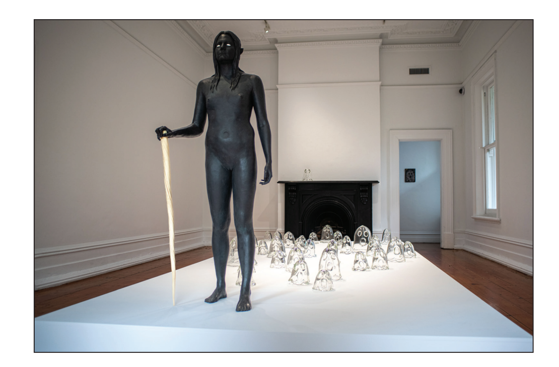
IMAGE > Nell, A white bird flies in the mist, a black bird flies in the night, a woman walks, wild and free, she is not afraid to die [installation view], 2008, bronze, mother of pearl, resin, hand-blown glass, dimensions variable.

to place. The title of the exhibition, Old New Wave , plays on the musical tern New Wave and pays homage to St Kilda as one of Australia's most important musical suburbs; the home of bands such as Hunters and Collectors and The Birthday Party and iconic venues including The Crystal Ballroom, the Espy and Prince of Wales. It reflects on St Kilda's bayside location and changing history as well as Linden's building, a site that for over a century has welcomed waves of people as it transformed from a private dwelling to a boutique hotel and now a contemporary art gallery.