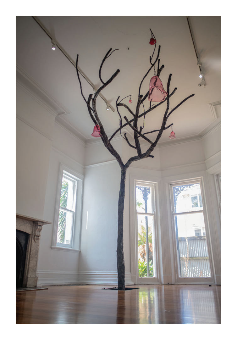
IMAGE > Nell, On a withered tree, ghosts bloom [installation detail], 2023, stainless steel, hand-blown glass, dimensions variable. Photograph: Liam James.

IMAGE > Nell, On a withered tree, ghosts bloom [installation view], 2023, stainless steel, hand-blown glass, dimensions variable. Photograph: Liam James.