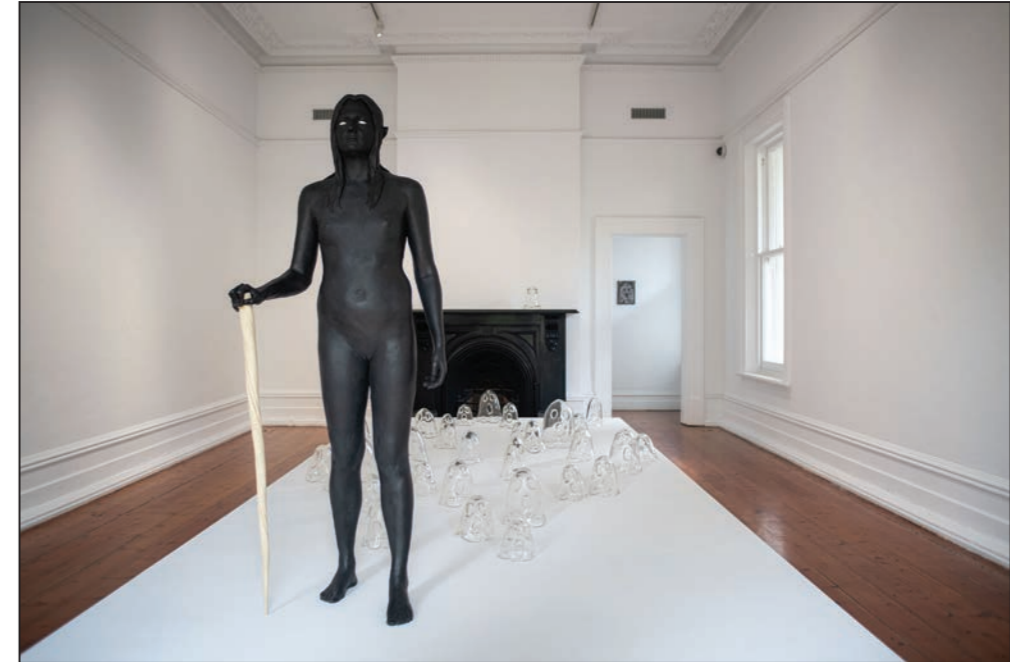
IMAGE > Nell, A white bird flies in the mist, a black bird flies in the night, a woman walks, wild and free, she is not afraid to die [installation view], 2008, bronze, mother of pearl, resin, hand-blown glass, dimensions variable.

to place. The title of the exhibition, Old New Wave , plays on the musical term New Wave and pays homage to St Kilda as one of Australia's most important musical suburbs; the home of bands such as Hunters and Collectors and The Birthday Party and iconic venues including The Crystal Ballroom, the Espy and Prince of Wales. It reflects on St Kilda's bayside location and changing history as well as Linden's building, a site that for over a century has welcomed waves of people as it transformed from a private dwelling to a boutique hotel and now a contemporary art gallery.