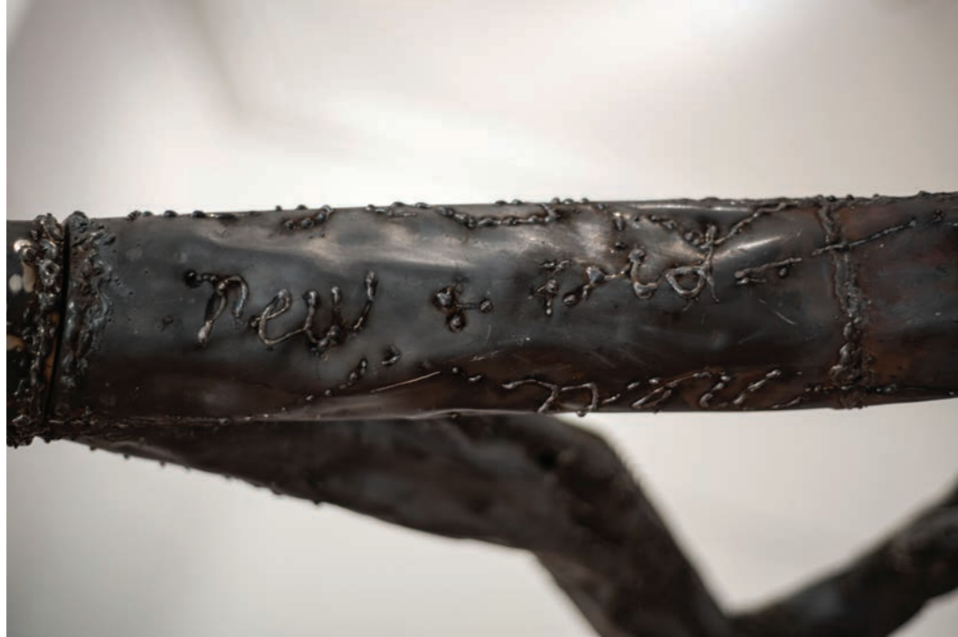
IMAGE > Nell, On a withered tree, ghosts bloom [installation detail], 2023, stainless steel, hand-blown glass, dimensions variable.