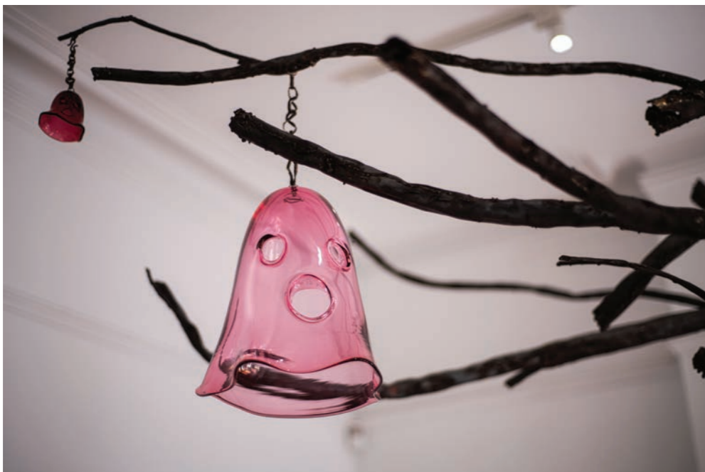
IMAGE > Nell, On a withered tree, ghosts bloom [installation detail], 2023, stainless steel, hand-blown glass, dimensions variable.

On a Withered Tree, Ghosts Bloom , a new work for this exhibition, a large leafless tree rises out of the building's foundations. It acknowledges the palimpsest of place embedded in this location; a plain populated with trees and vegetation, cared for by First Nations People prior to settlement and a building built by migrants and named after a German lime tree. It is a tree that welcomes us under its canopy and while dormant remains in a state of growth and flux.