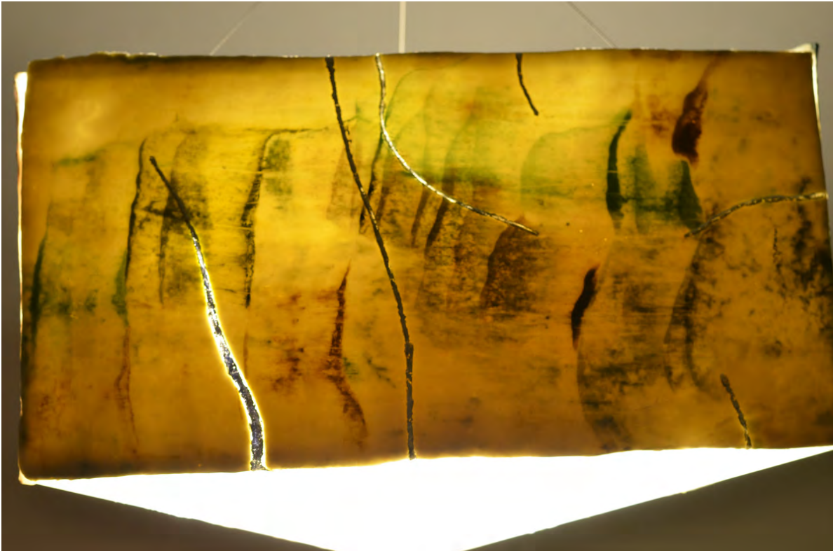
Triptych Float, 2023 Porcelain, perspex, LED, gold leaf, wire $3,600 AUD