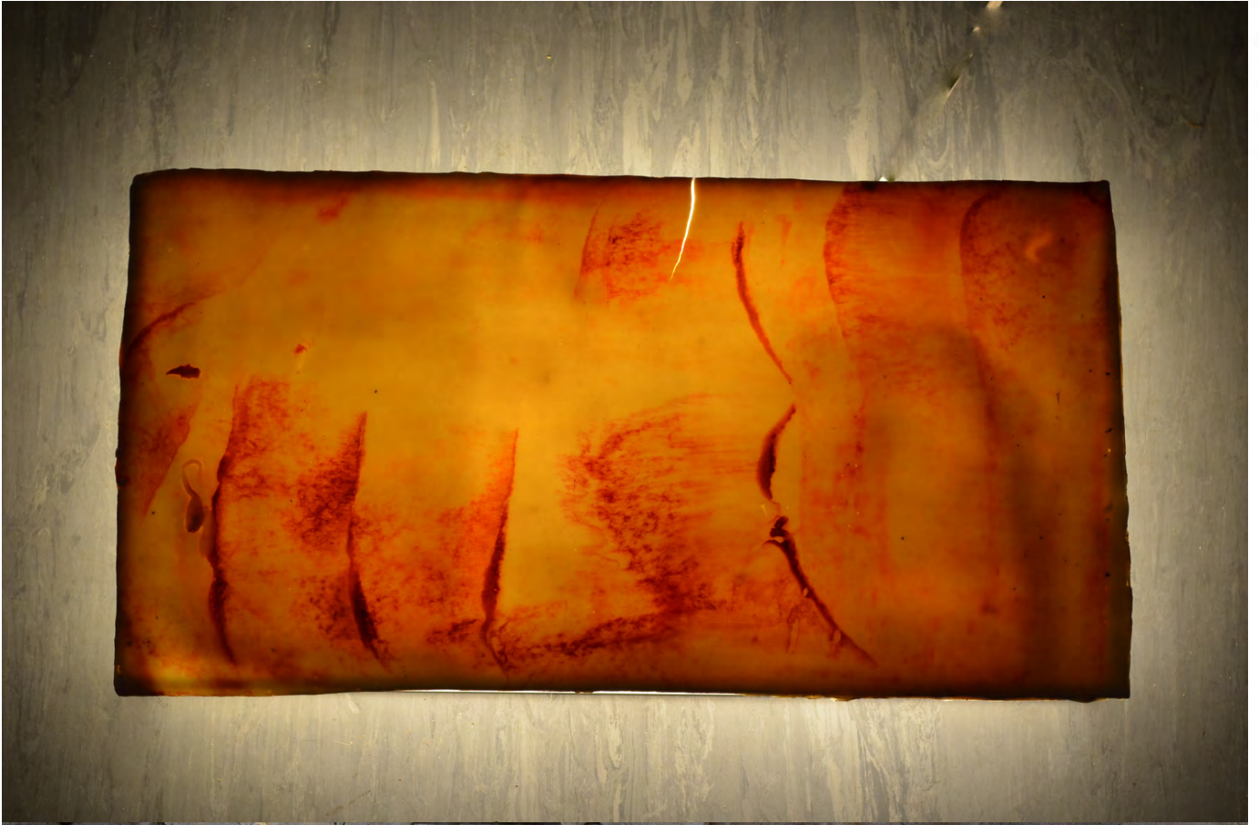
Sound Makes Light, 2023 Porcelain, perspex, LED, gold leaf, wire 44 x 23 x 6 cm. $1,880 AUD