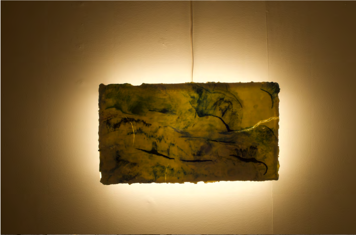
Blue Luminance, 2023 Porcelain, perspex, LED, gold leaf 44 x 23 x 6 cm $1880