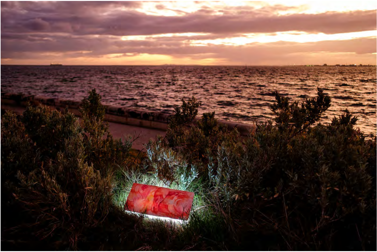
Elwood Beach, Port Phillip.