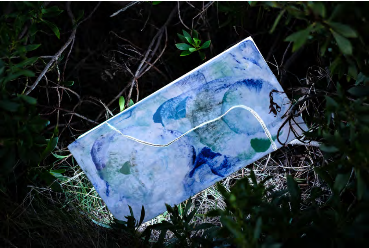
Elwood Beach, Port Phillip.