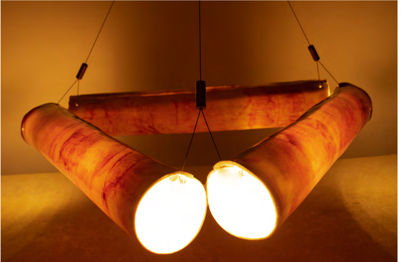
TriVertex, 2023 Porcelain, perspex, LED, gold leaf, wire 68 x 68 x 9 cm $4,600 AUD

Powered through a single wire, TriVertex is a light system of stunning balance and geometry. When turned off, TriVertex is a fine art sculptural object. Turned on, it becomes a light that appears to float in space weightlessly. Its bespoke wire junction fixtures are completely minimalist, creating an individual balancing adjustment of each end of each linear, allowing power to be transmitted through a single upper wire.