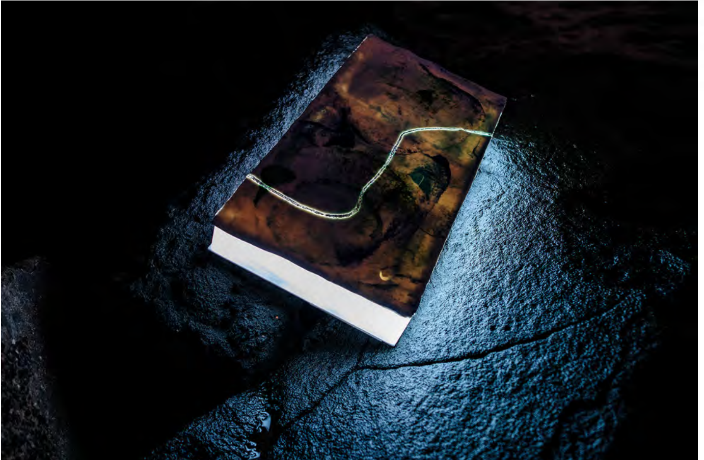
Earth at Night, 2023 Porcelain, perspex, LED, gold leaf 44 x 23 x 6 cm SOLD