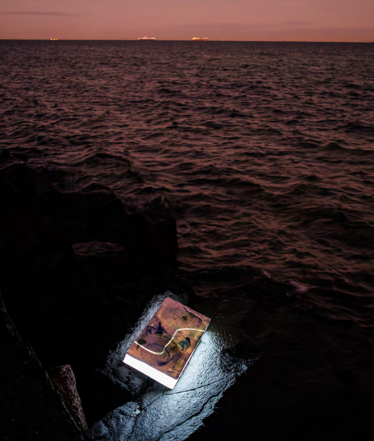
Elwood Beach, Port Phillip.