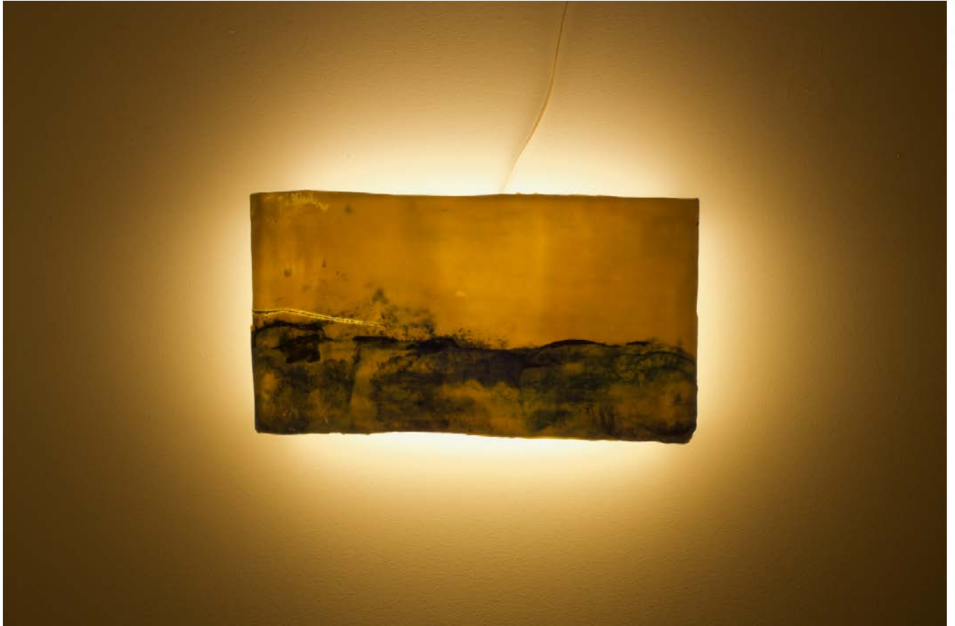
Horizon Forcefield, 2023 Porcelain, perspex, LED, gold leaf 44 x 23 x 6 cm $1880