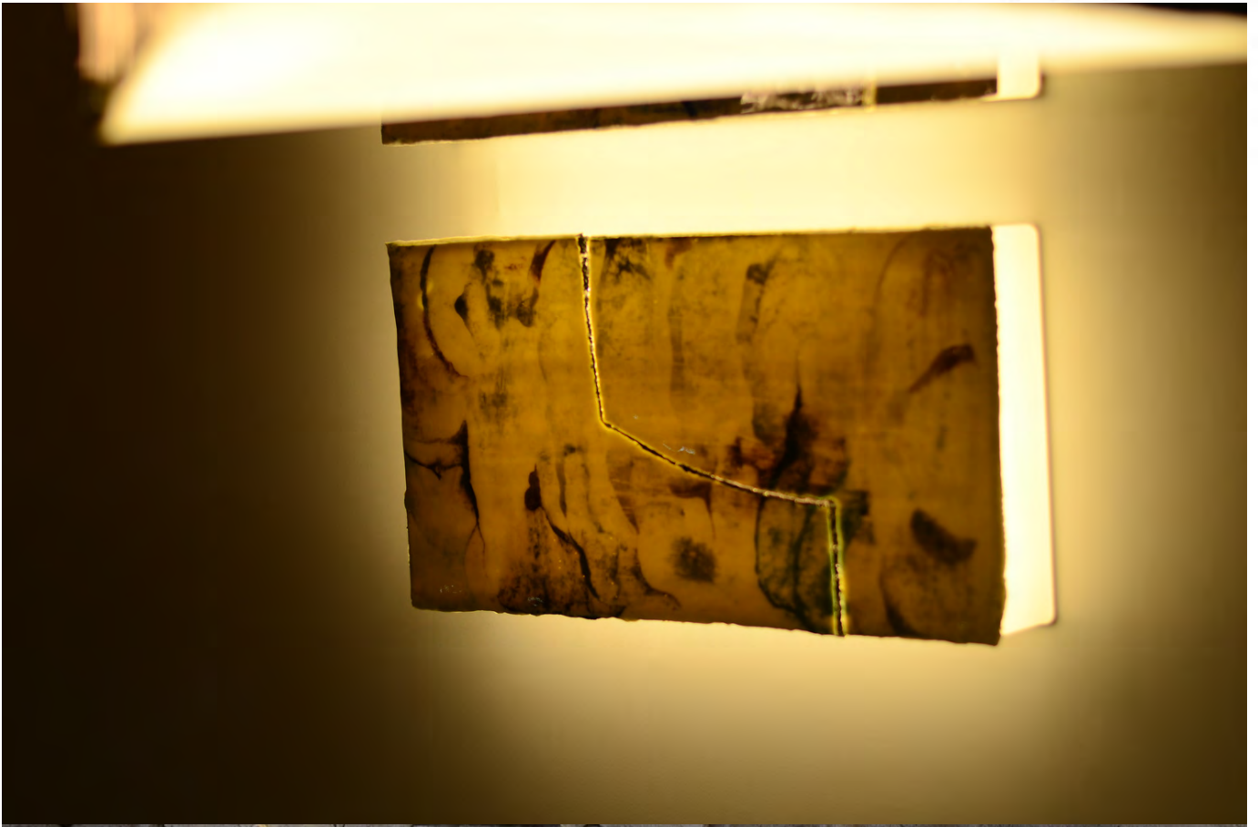
Zig Zag Flame, 2023 Porcelain, perspex, LED, gold leaf, wire 44 x 23 x 6 cm. NFS