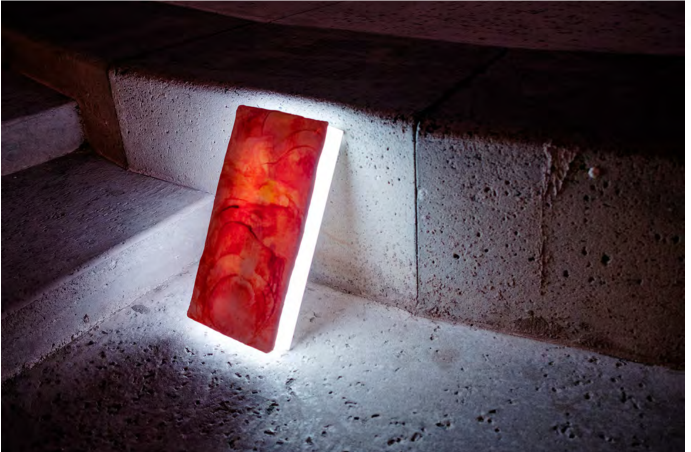
Firelight, 2023 Porcelain, perspex, LED, gold leaf 44 x 23 x 6 cm $1,880 AUD