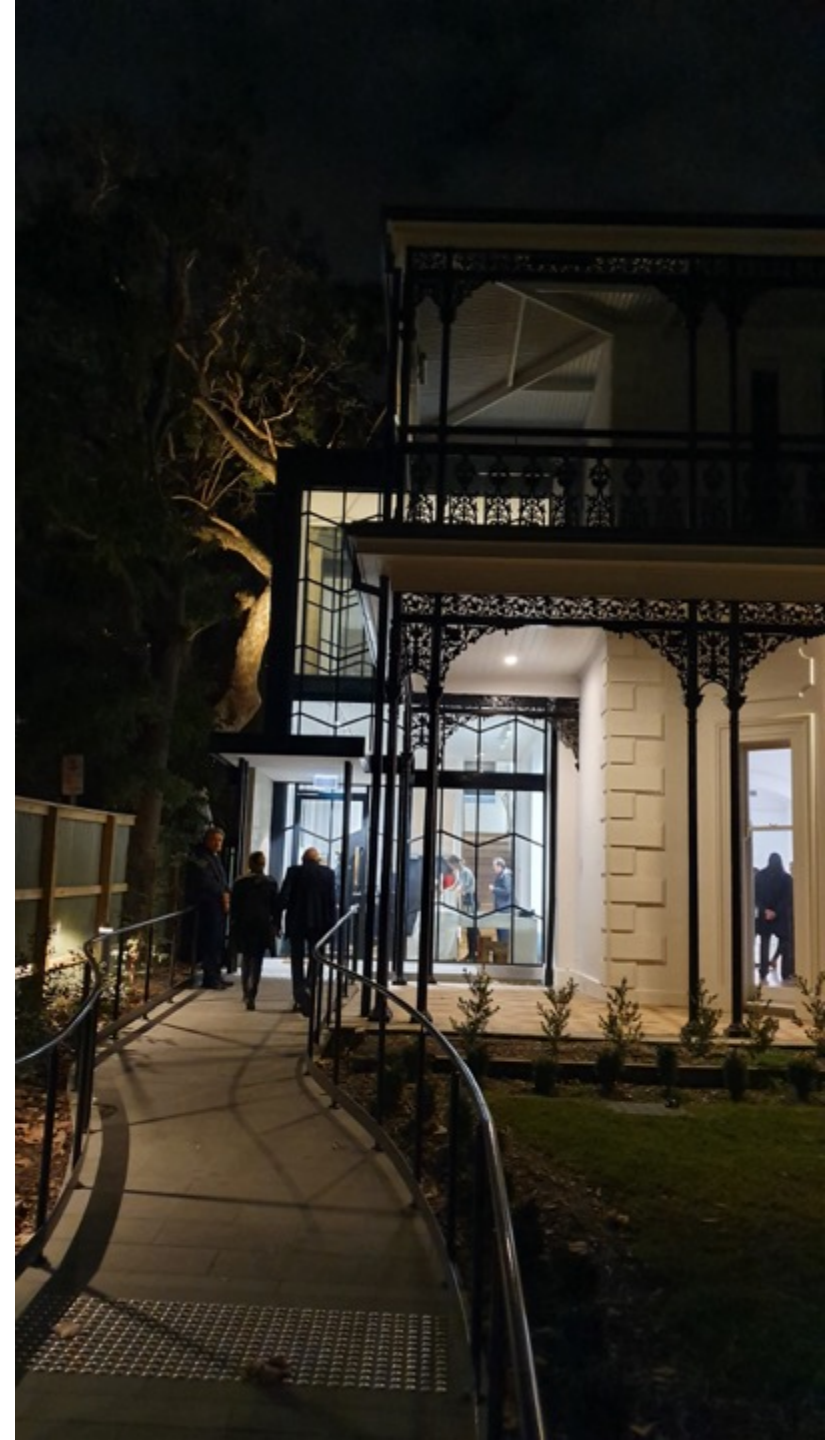
IMAGE > Guests at the opening of the Linden New Art, June 2019.

In 2020, our plans have been turned upside down and we are adapting to a COVID-19 world.